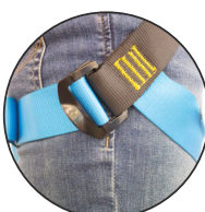
Easy slide buckles