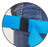
Elastic webbing retainers