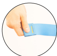
Bigger Webbing turnbacks