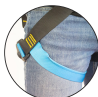
Coloured right leg loop