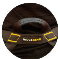
Front attachment point