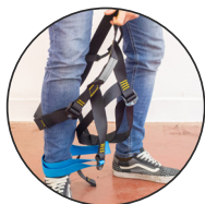
Step in design