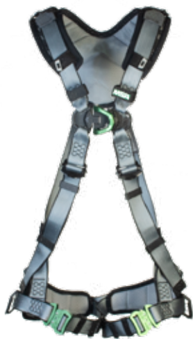
V-FIT, Back/Chest D-Ring (P/N 10206534)