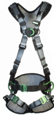
V-FIT, Back/Chest/Hip D-Ring with waist belt (P/N 10206546)