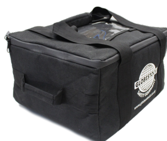
Holdall bag GSE-H/ALL