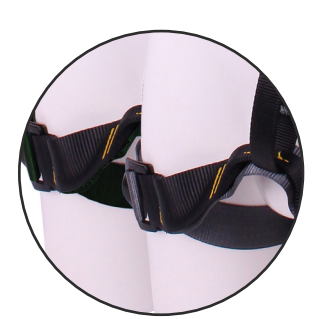
Colour coded webbing